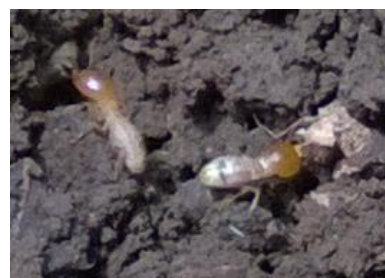
Figure 2. Subterranean termites ( Macrotermes gilvus ) were found on tested samples

The durability field test shows that wood damage was mostly caused by subterranean termites' attacks, particularly Macrotermes gilvus (Figure 2). Besides, there were also some fungal attacks. Heavy damage occurred in ganitri and sengon woods due to termite attacks, while less damage occurred in jackfruit wood (Figure 3). The weight loss of ganitri wood was 86.4%, while in sengon and jackfruit woods were 64.4% and 0.7%, respectively.